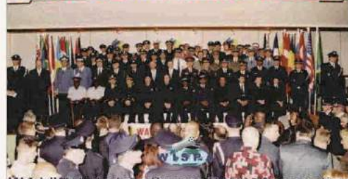
WorldWide Indoor Soccer Police Association