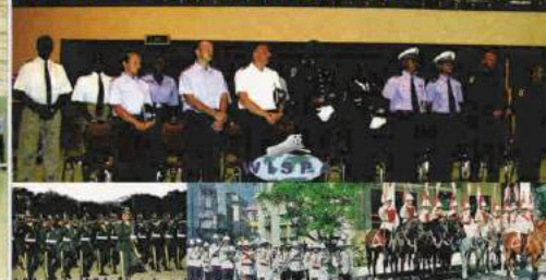
WorldWide Indoor Soccer Police Association