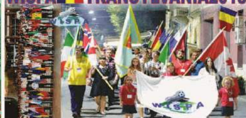
WorldWide Indoor Soccer Police Association