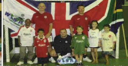
WorldWide Indoor Soccer Police Association