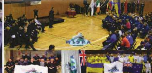
WorldWide Indoor Soccer Police Association