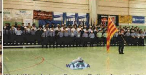
WorldWide Indoor Soccer Police Association