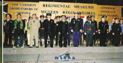
WorldWide Indoor Soccer Police Association