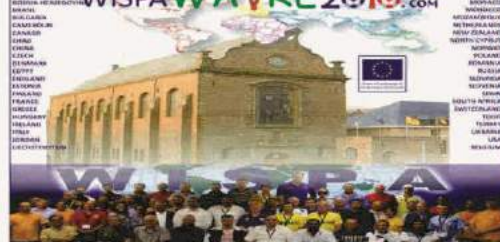
WorldWide Indoor Soccer Police Association