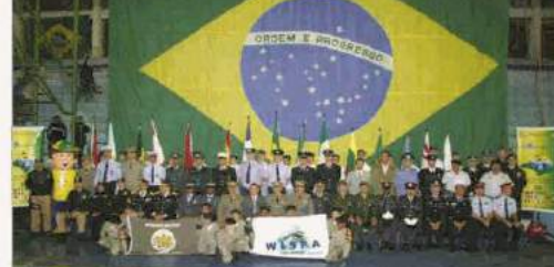
WorldWide Indoor Soccer Police Association