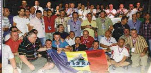
WorldWide Indoor Soccer Police Association