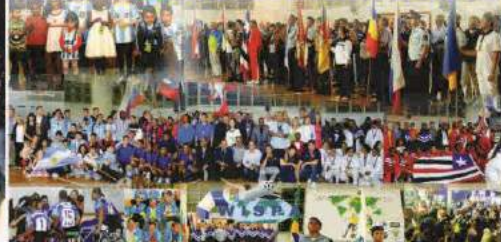
WorldWide Indoor Soccer Police Association