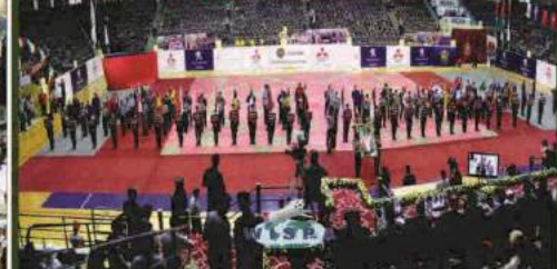
WorldWide Indoor Soccer Police Association