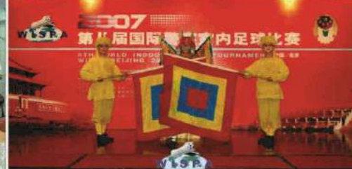
WorldWide Indoor Soccer Police Association