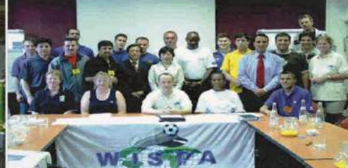
WorldWide Indoor Soccer Police Association