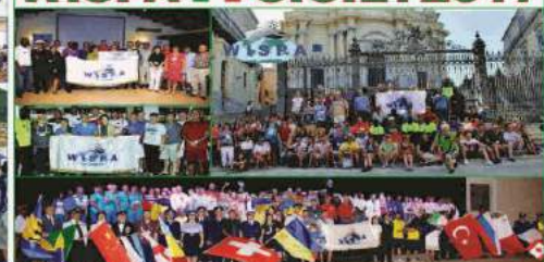
WorldWide Indoor Soccer Police Association