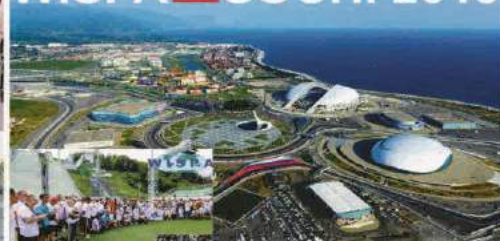
WorldWide Indoor Soccer Police Association