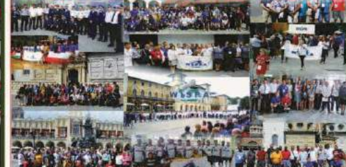
WorldWide Indoor Soccer Police Association