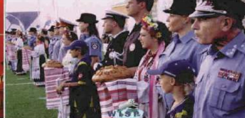
WorldWide Indoor Soccer Police Association