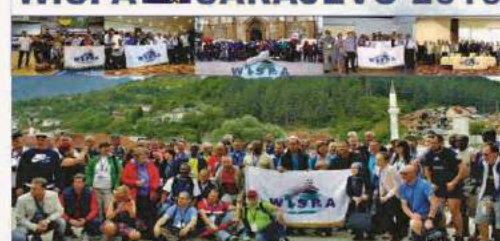
WorldWide Indoor Soccer Police Association